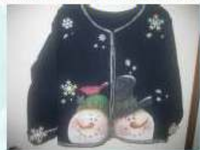
Snowman Jacket Navy Sweatshirt Acrylic Julie Tews