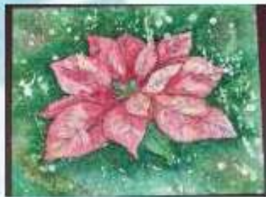
Poinsettia on Rice Paper 10"W x 8"H Rice Paper w/Mat Watercolor Batik Kathy Driggs