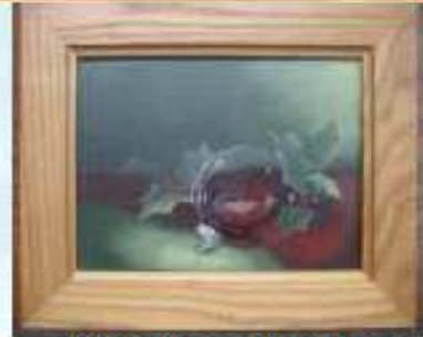
Christmas Ornament Approx 9-1/2"x11-1/2" Wood Door – sizes may vary Oils Sandy Young & Kim Raycraft