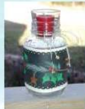
Candle Wrap Mason Jars w/wrap Acrylic Vera Collier

Don't Forget To Sign up Early - Spaces Are Limited