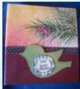
Christmas Photo Album 10-1/4" x 11" Canvas Album Acrylic/Mixed Media Chris Keppel