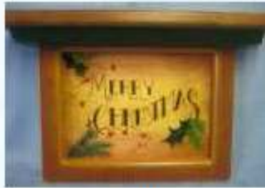
Merry Christmas Sign 9"H x 14"W x 2-1/2"D Wood shelf Acrylic Rebecca Ann Hilbert