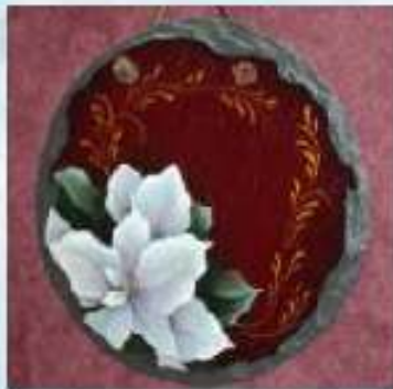
White Poinsettia Slate- approx 7" diam. Acrylic Diana Rochowiak