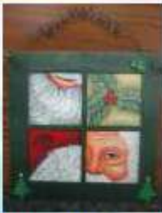
The Day After Christmas 8"W x 8"H Wood Ornament / Wallhanging Acrylic – Pat Boog